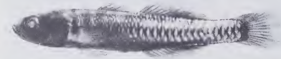
Figure 5 Hypseleotris kimberleyensis , male holotype, 34 mm SL, Barnett River, Western Australia.

dorsal fin, more distinct anteriorly. Scales edged in dark brown, edgings darkest on midside forming a row of X-shaped marks just below midside. A small dark brown spot on posterior end of caudal peduncle just below midside. Median fins dark brown to black in males, dusky in females. Second dorsal and anal sometimes with a thin whitish longitudinal stripe just below middle of fin; distal margin usually lighter than rest of fin, but without a distinct white margin. No white spots on fins. Pectoral and pelvic fins dusky to clear. Caudal fin sometimes with two thin vertical wavy lines near base.